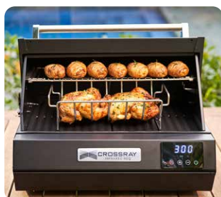
High hood design, includes warming rack