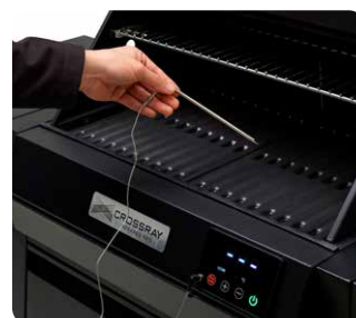
Meat probe included to set the preferred cooking temperature