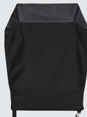
Electric BBQ & Trolley with protective cover