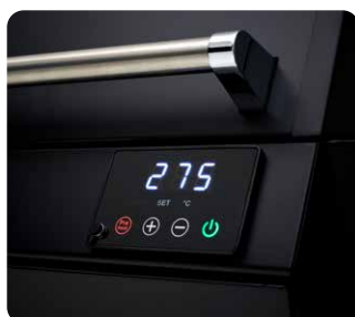
Digital, programmable control panel