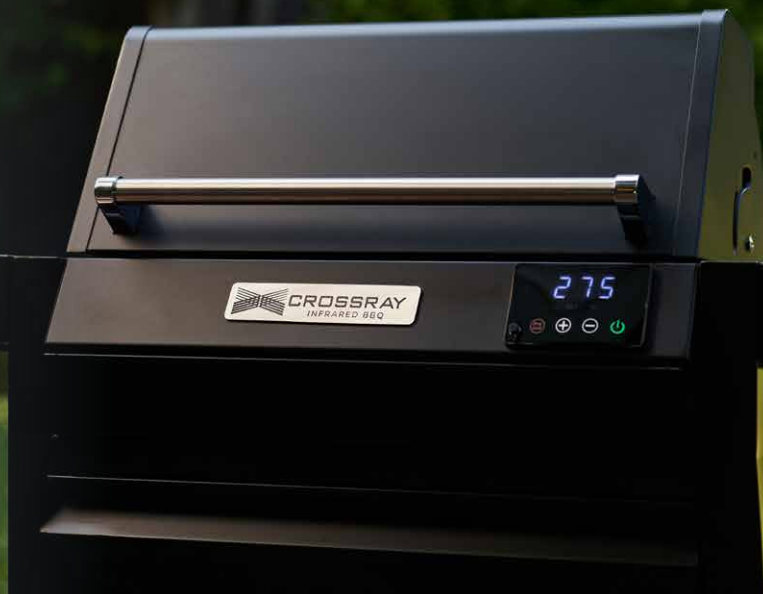
eXtreme Electric BBQ Trolley