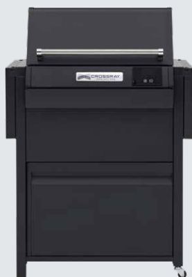
Electric BBQ with trolley and side shelves folded down