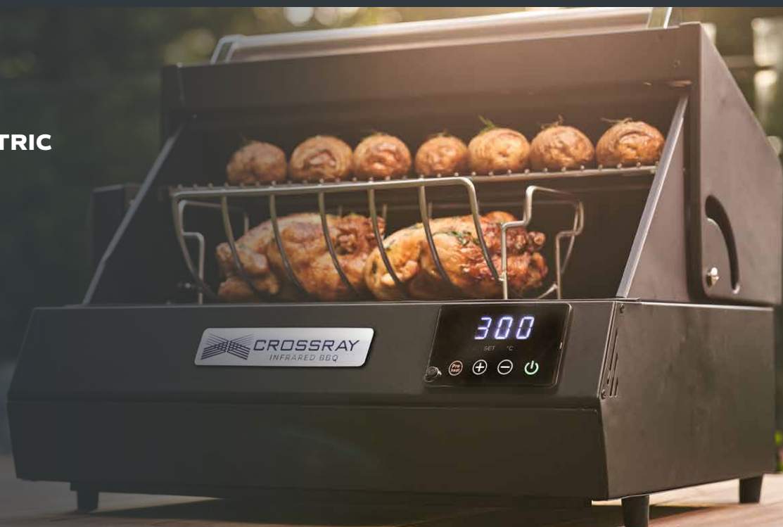
eXtreme Electric BBQ