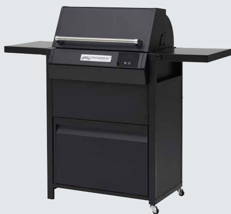
Electric BBQ with trolley and side shelves extended